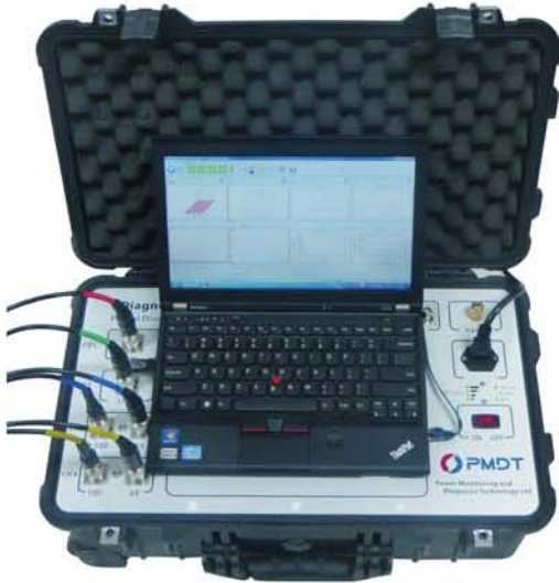
PDiagnosticG (4UHF + 2AE)

The PDiagnosticG utilizes UHF and AE sensors to detect, analyze, and diagnose the partial discharge signals in GIS with a combination of acoustic-electric detection technologies. The signals detected are transmitted to the Laptop through the processes of amplification, envelope detection, collection, and signal pre-processing. The PDiagnostic Software installed on the included Laptop digitally filters and extracts the characteristic fingerprint, excludes the disturbance signals, identifies the defect type, and evaluates the insulation PD condition of the GIS through the Intelligent Diagnostic System.