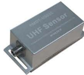
External UHF Sensors